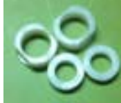
C253/353fusing part Gear16T ME07-007-1107