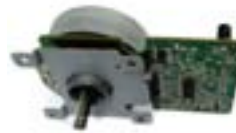
DI2510/3510 BH-250/350 Main Motor ME01-003-0045