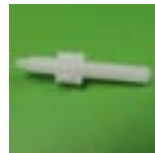
DI162/163/1611 Magnetic stick pin ME01-003-0056