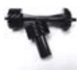
DI162/1611/163 Shaped gear ME01-003-0083