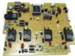
C250/252 High pressure plate ME07-007-0731