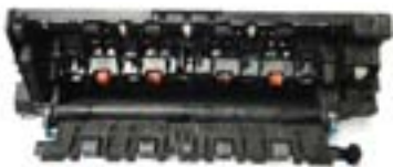
KONICA MINOLTA DI420/500 Fusing Unit ME07-007-0705