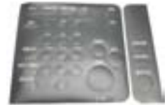
BH250/350 Panel sticker ME01-005-0108