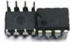
Bz420/500 Print Card ME07-007-0729