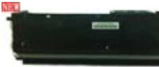
ME07-007-1160 BH250/350 new developer unit