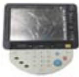
BZ-C353 Panel (All new) ME01-005-0139