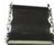
KONICA MINOLTA .C 250/252 Transfer belt ME07-007-0722