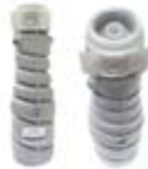
BH250/350 TONER ME01-006-0120