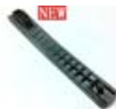
ME01-004-1180 BH600/750/850 2nd tray handle