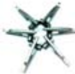
BZ600.750.850(A) Picker Finger ME01-003-0201