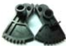
C253/353fusing part Pressure release lever ME07-007-1113