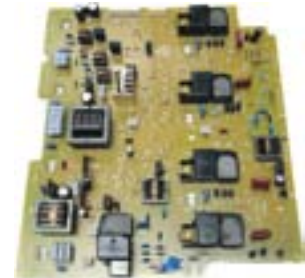
C203/253/353 High pressure plate ME07-007-0732