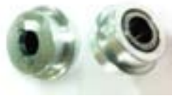
ME01-004-3240 BH250/350 Single roller