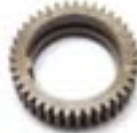
BH250/350 DI2510/3510 Fuser Gear ME01-003-0079