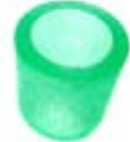
DI2010/3010/ 2510/3510/BH250/350 Bypass pickup roller ME01-001-0004