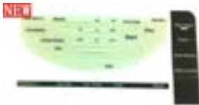
ME01-007-0515 BHC451/550/650 Panel sticker E