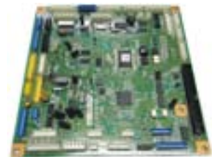
Di2510/Di3510 Mother Board ME07-007-0735