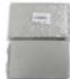
DI2510/3510 BZ250/350 Front cover(Small) ME01-004-0100