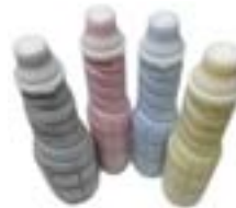
C500 Toner Cartridge C、M、Y、K ME01-006-0134