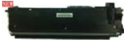
ME07-007-1166 BH363 NEW Developer unit