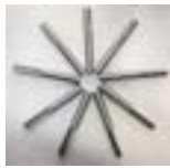
DI2510.3510 BH250.350.163.183 Main Motor Axis ME01-003-0205