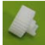
DI-2510 Main Motor Gear ME01-003-0052