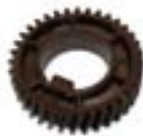
C451 fusing part Gear35T ME07-007-1110