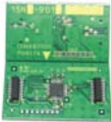
Bz600 Print Card ME07-007-0730