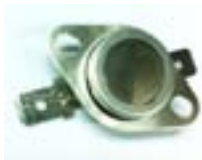
ME07-007-1156 BHC250.252 Thermistat