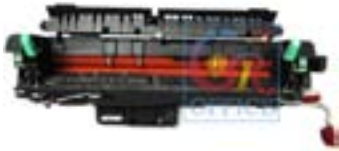
ME07-007-0703 4038R77311, 4038R77300, 4038-R722-00, 4038-0754-00 BHC250/252 fuser unit