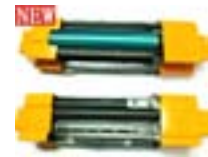
ME01-003-1194 BHC452 black imaging unit K