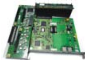
C250/252/352 Fax Card ME07-007-0734