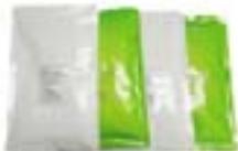
DI251/351/250/350 DI162/152/183/1611/2010 /3010/2510/3510 Developer DV110 ME01-006-0113