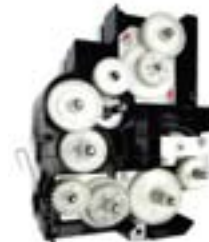
KONICA MINOLTA BH250/350 Drive gear assembly ME07-007-0726