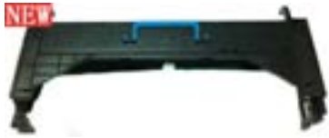
ME07-007-1165 BH363 NEW Drum unit