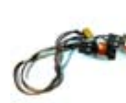
C450/351/350 Upper and lower pressure relief spring ME07-007-1142