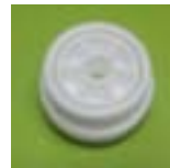
4030250501 Konica minolta Gear(Original) ME01-003-0068