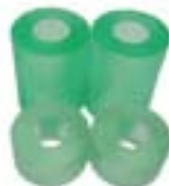
DI251/351/2010/3010/ 2510/3510/BH250/350 ADF Double 4pcs ME01-002-0029