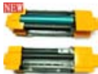
ME01-010-1199 BHC451/550/650 Imaging unit BK