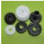
DI152/162/163/183/ 1611/2011BH210 Imaging Gear ME01-003-0051