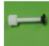
DI162/1611/163 Waste toner recycling bar ME01-003-0057