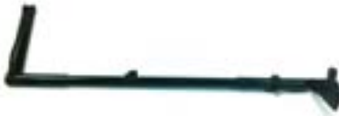
ME01-008-2346 C250/252 paper exit sensor