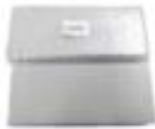
DI2510/3510 BZ250/350 Front cover(big) ME01-004-0099