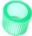
DI2010/3010/2510/3510/ BH250/350 ADF (With teeth) ME01-001-0010