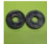
DI2010/2510/3010/3510 BH200/210/250/350 Drum clearance round ME01-003-0038