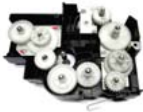
KONICA MINOLTA DI2510/3510 Drive gear assembly ME07-007-0723