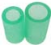
DI650/750/ K7145/7165 BH600/700/750 ADF 2pcs ME01-002-0028