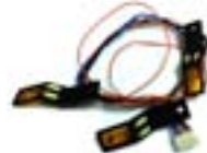
C451 fusing part Thermistor ME07-007-1115