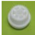
4040255101 Konica minolta Gear(Original) ME01-003-0067