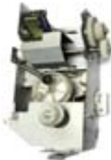
KONICA MINOLTA BH250/350 Add flour components ME07-007-0725