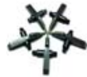
C450/351/350 Upper pick finger ME07-007-1139