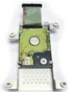
C250/252/352 Hard disk ME07-007-0733