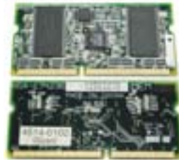
DI2510/3510 Scan Card ME07-007-0737