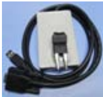
C250/350/252/352/ 353 Chip reader ME01-010-0136