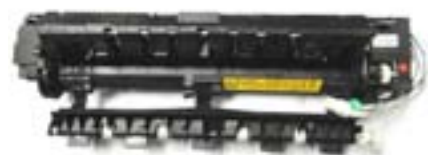
KONICA MINOLTA DI162/1611/2011 Fusing Unit ME07-007-0708