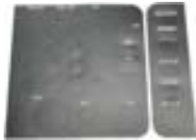
DI2510/3510 Panel sticker ME01-005-0109