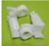
DI251/351 Transfer Stand ME01-003-0031