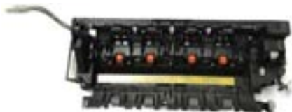
KONICA MINOLTA DI2510/3510 Fusing Unit ME07-007-0707