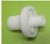
4030536701 Konica minolta Gear(Original) ME01-003-0062

For Drum the gear(Need for Change Often)