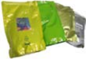
DI152/156/162/183/200/251/351/2010/ 2510/3010/3510/BH200/250/350/450/ 470/650/750/BZ600/700/750/850/920/ 1050 K 7165/7155/7145/7020 TONER ME01-006-0119