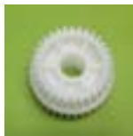
4030252601 Konica minolta Gear(Original) ME01-003-0071