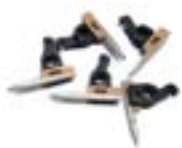
DI450 /EP3050 Upper Picker Finger ME01-003-0043