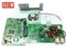
ME07-007-1162 BH163 fax card