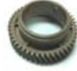
DI450.470.550 fuser gear ME01-003-0202