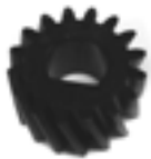
C451 fusing part Gear16T ME07-007-1105