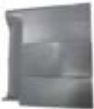
DI2510/3510/BZ350 BH420/500 Pickup Cover ME01-004-0098