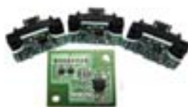
ME01-007-0508 BHC451/550/650 hip BHC、M、Y、K