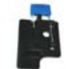
C451 fusing part Resistance ME07-007-1116