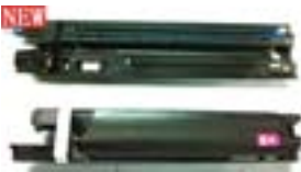
ME01-003-1192 BHC452 red imaging unit M