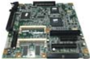
Di2510/Di3510 BH350/250 C350/450/451/253/353 Image processing Board ME07-007-0736