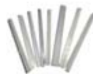
DI2510/3510/251/351 BH250/350 Blade ME01-008-0118