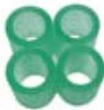
EP2030/3050/30004000/5000/ 6000/6001 pickup roller 4pcs ME01-002-0025