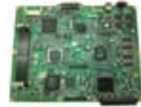
ME07-007-1172 BHC252 mother board