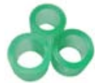
K-7020 Pickup roller 3pcs ME01-002-0024