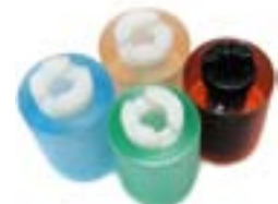
DI2010/3010/2510/3510 BH250/350 Original Material Pickup Roller ME01-002-0030