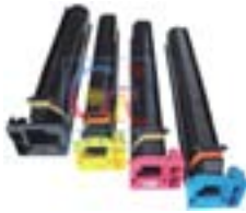
ME01-006-1200 BHC452/552/652 Toner Cartridge BHC、M、Y、K