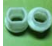
C253/353fusing part Gear23T ME07-007-1103