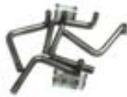
C451 fusing part Spring ME07-007-1114