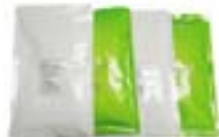
Developer DV211/311 BH200/250/350 ME01-006-0114