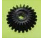
1165531101 Konica minolta Gear(Original) ME01-003-0059