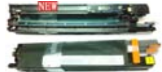
ME01-010-1198 BHC451.550.650 Imaging unit