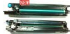
ME01-003-1191 BHC452 blue imaging unit C