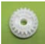
4040254601 Konica minolta Gear(Original) ME01-003-0070