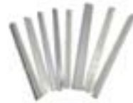
ME01-008-0514 BHC451/500/550/650 black blade