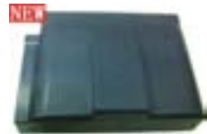
ME01-004-0206 BHC451/253/353/550/650 Pickup Cover