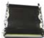
KONICA MINOLTA C300/352 Transfer belt ME07-007-0721