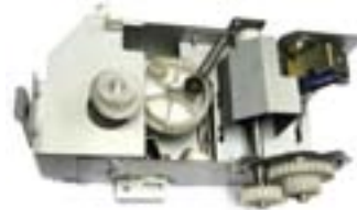
KONICA MINOLTA DI2510/3510 Add flour components ME07-007-0724