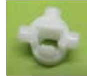
4002525901 Konica minolta Gear(Original) ME01-003-0061

For Drum the gear(Need for Change Often)