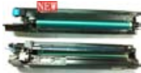
ME01-010-1196 BHC451/550/650 Blue imaging unit C