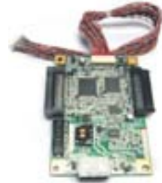
BH250/350 Fax Card ME07-007-0738