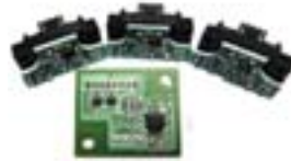
ME01-006-1201 BHC452/552/652 Chip BHC、M、Y、K