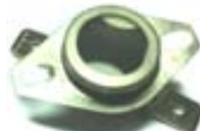
C253/353fusing part Thermistat ME07-007-1114