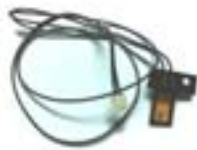
C253/353fusing part Bearing(3) ME07-007-1123