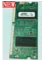
ME07-007-1163 BH163 128MB memory