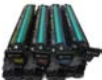
C200/253/353 Drum Unit C、M、Y、K ME01-007-0125