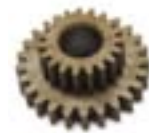
K7165/7155/650 Cleaning gear ME01-003-0081