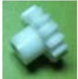
C253/353fusing part Gear16T ME07-007-1105