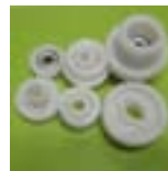
BZ600/750/850/920/1050 K7020 Imaging Gear ME01-003-0088