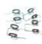
ME07-007-1159 BHC250.252 picker finger spring