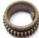
DI152/162/1611/163/183/ 2011 Fuser Gear ME01-003-0080