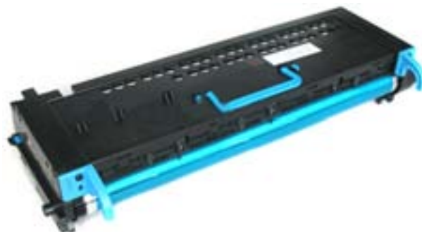
DI2510/3510/BH250/350 PR-310 Drum Unit ME07-007-0741