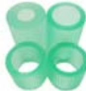
DI2010/3010/2510/3510/B H250/350 ADF 4pcs ME01-002-0023