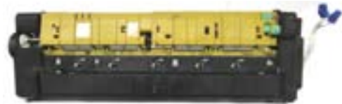
KONICA MINOLTA C350/450 Fusing Unit ME07-007-0702