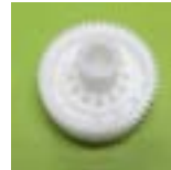
4030251001 Konica minolta Gear(Original) ME01-003-0064