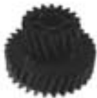
C451 fusing part Gear18-31T ME07-007-1109