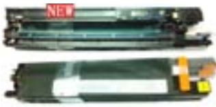
ME01-003-1193 BHC452.552.652 image unit