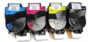
C350/351/450 Toner Cartridge C、M、Y、K ME01-006-0135