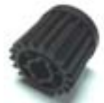
C253/353fusing part Gear35T ME07-007-1110