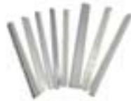
ME01-008-0513 C200/253/353/250/252/ 352/ BHC350/351 Blade