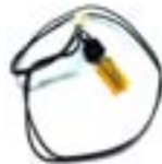
ME07-007-1153 BHC250/252 Thermistor2