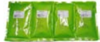
C200/253/353/250/252/352/ 350/351 Developer (Foreign imported Domestic Packing) C, M, Y, K ME01-006-0138