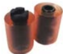
ME01-001-0147 4030-3005-01,65JA40060 DI251/351/2010/3010/2510/3510/ BH250/350 Pickup roller