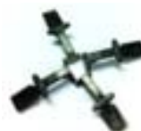
ME07-007-1158 BHC250.252 lower picker finger