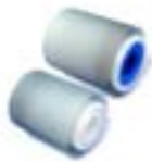
DI3510/2510/3010/ 2010/BH250/350/200 ADF (Original With core) ME01-001-0017