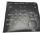
C250/350/450/252/352 Panel sticker Welcome to sample made ME01-005-0141