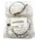
DI2510/3510 BH250/350 Thermistor (Original) ME01-003-0046