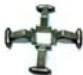
ME07-007-1157 BHC250.252 upper picker finger