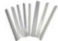
C200/253/353/250/252/ 352/ C350/351 Scraper ME01-008-0142