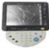
BH421/501 Panel (All new) ME01-005-0110