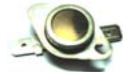
C253/353fusing part Thermistat ME07-007-1115