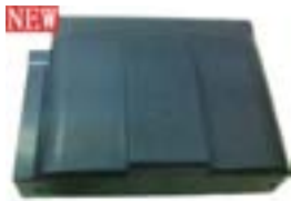
C451/253/353/550/650 Pickup Cover ME01-004-0206