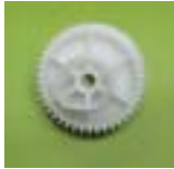
40305368020 Konica minolta Gear(Original) ME01-003-0058