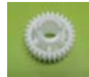
4030254501 Konica minolta Gear(Original) ME01-003-0069