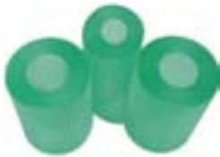
DI251/351 Pickup roller(with teeth) 3pcs ME01-002-0021