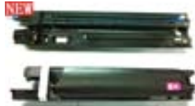
ME01-010-1197 BHC451/550/650 Red imaging unit M