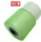
BH C450/250/252/352 1st pickup roller