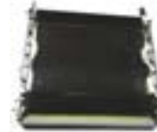
KONICA MINOLTA C350/450 Transfer belt ME07-007-0719