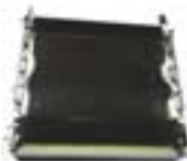
KONICA MINOLTA C203/253/353 Transfer belt ME07-007-0720