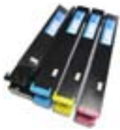
C250/252/352 Toner Cartridge C、M、Y、K ME01-006-0132