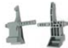
DI2510/3510 BH250/350 Side door hook (Original) ME01-003-0049