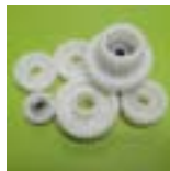
K7145/7155/7165 Imaging Gear ME01-003-0087