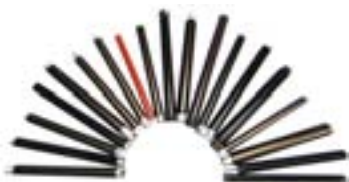
DI251/351/250/350/162/ 152/183/1611/2010/3010/2510/3510/BH250/350 Upper and lower Roller ME01-008-0117