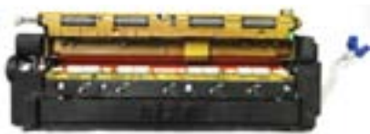
KONICA MINOLTA C300/352 Fusing Unit ME07-007-0703