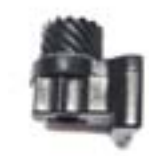
DI162/1611/163 Imaging gear ME01-003-0089