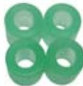
DI650/750/ K7145/7165 BZ600/700/750 pickup roller 4pcs ME01-002-0026