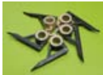
DI251/351 Lower Picker Finger ME01-003-0039