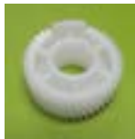
4030251101 Konica minolta Gear(Original) ME01-003-0066