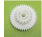
4030536702 Konica minolta Gear(Original) ME01-003-0065