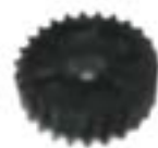
C451 fusing part Gear25T ME07-007-1112