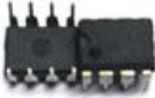
Bz751 Print Card ME07-007-0727