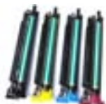
C250/252/352 Drum Unit C、M、Y、K ME01-007-0126