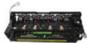
KONICA MINOLTA BH250/350 Fusing Unit ME07-007-0706