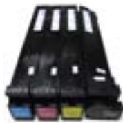
C200/253/353 Toner Cartridge C、M、Y、K ME01-006-0133