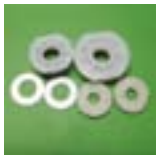
DI162/183/1611 Developing bearing ME01-003-0035