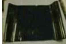
ME07-007-0721 4038-R743-00, 4038-0777-00 BHC250/252/352 transfer belt