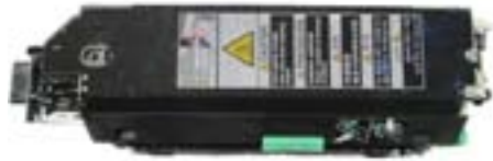
KONICA MINOLTA B600/750 Fusing Unit ME07-007-0709