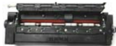
KONICA MINOLTA C203/253/353 Fusing Unit ME07-007-0704