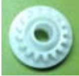
C253/353fusing part Gear ME07-007-1101