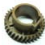
C253/353fusing part Gear24T ME07-007-1111