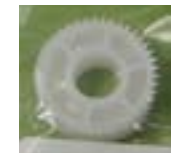
DI-2510 Main Motor Gear ME01-003-0073