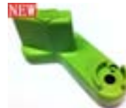
BH600/750/850 Handle ME01-003-2347