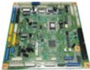
BH250/350 Mother Board ME07-007-0740